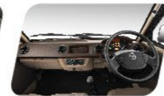
DUAL TONE INTERIORS

For further details, please contact: 1800 1022 666 (toll-free) www.ashokleyland.com Or write to us at: Ashok Leyland Limited, 6th Floor - LCV Marketing, No.1 Sardar Patel Road, Guindy, Chennai - 600 032. Tel: (044) 22206000